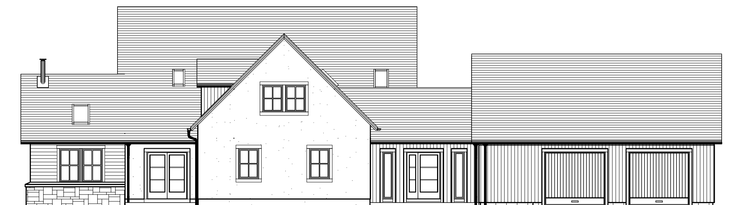
NORTH ELEVATION ... 1:100