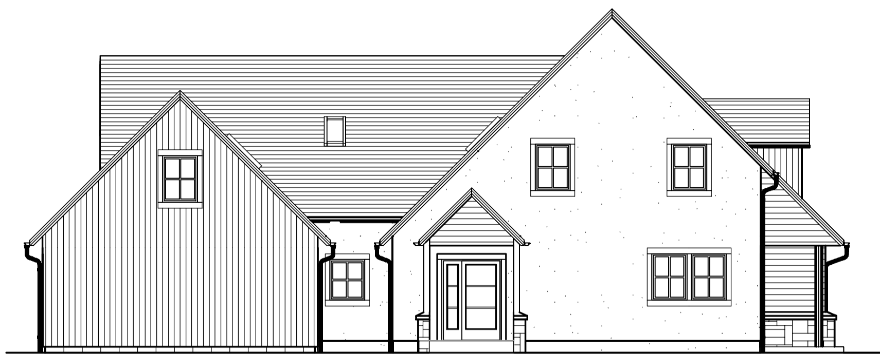
WEST ELEVATION ... 1:100